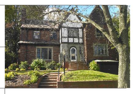
NO. 148: SEPTEMBER 25, 2018